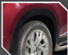
Helps restore Rich Black color