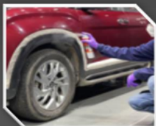
Easy to Apply & Quick-drying